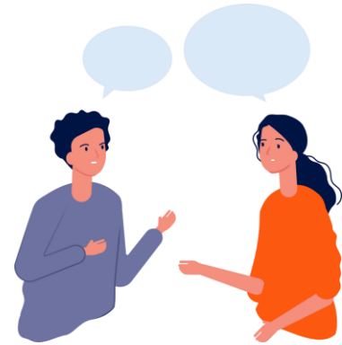
Residence Fellow Chats