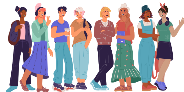
Student Led Initiatives