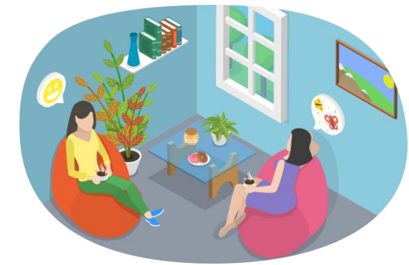
Shared Space Connections