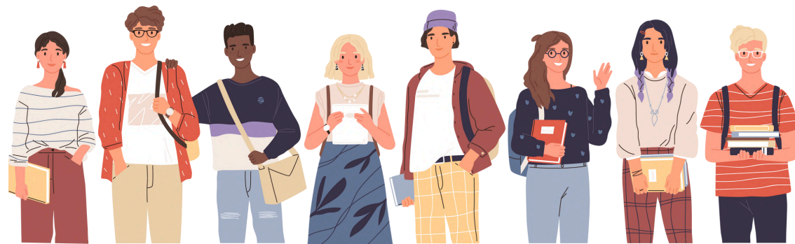
Student Led Initiatives