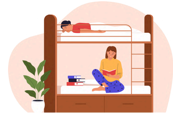
Shared Spaces Agreement